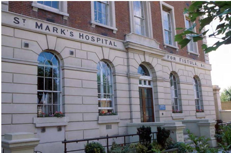
Figure 2. The old St. Mark's Hospital at City Road.

cyst-like surface tumours. Dukes was the first to describe the psychological aspects of the disease in 1952 and stated that “in the study of polyposis scientific enthusiasm must always be tempered with sympathy and tact” [38] Furthermore, in this article Dukes presented his poetic visions about future gene therapy: