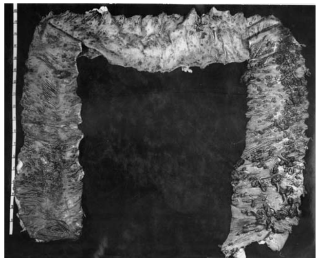
Figure 4. Old colectomy specimen from St. Mark's Hospital.

The same year Dukes [39] presented detailed results based on 156 cases from 41 families in the St. Mark's Hospital Polyposis Registry. In 1955, Reed & Neel [40] presented a detailed genetic study and calculated the frequency at birth to be 1:8,300.